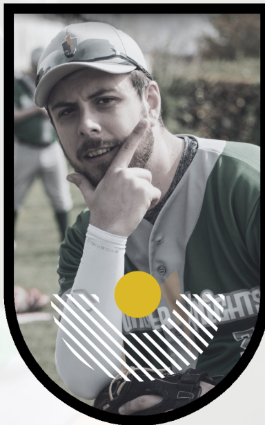
Fundraising & Grants Officer